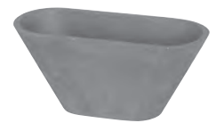
Option FO / 863-FNO