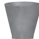
Option F / 863-FN