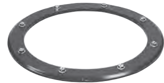
Option C / 860-C