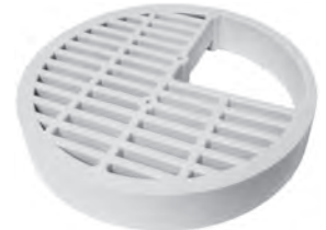
Option 3 / 860-WGP3