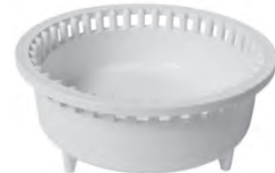
Option S / 860-WS