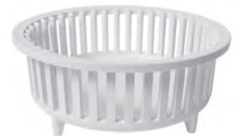
Option U / 860-WU