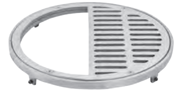
Option 2 / 860-RGN2